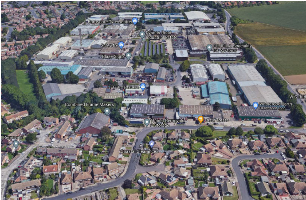
Pyson's Industrial Estate